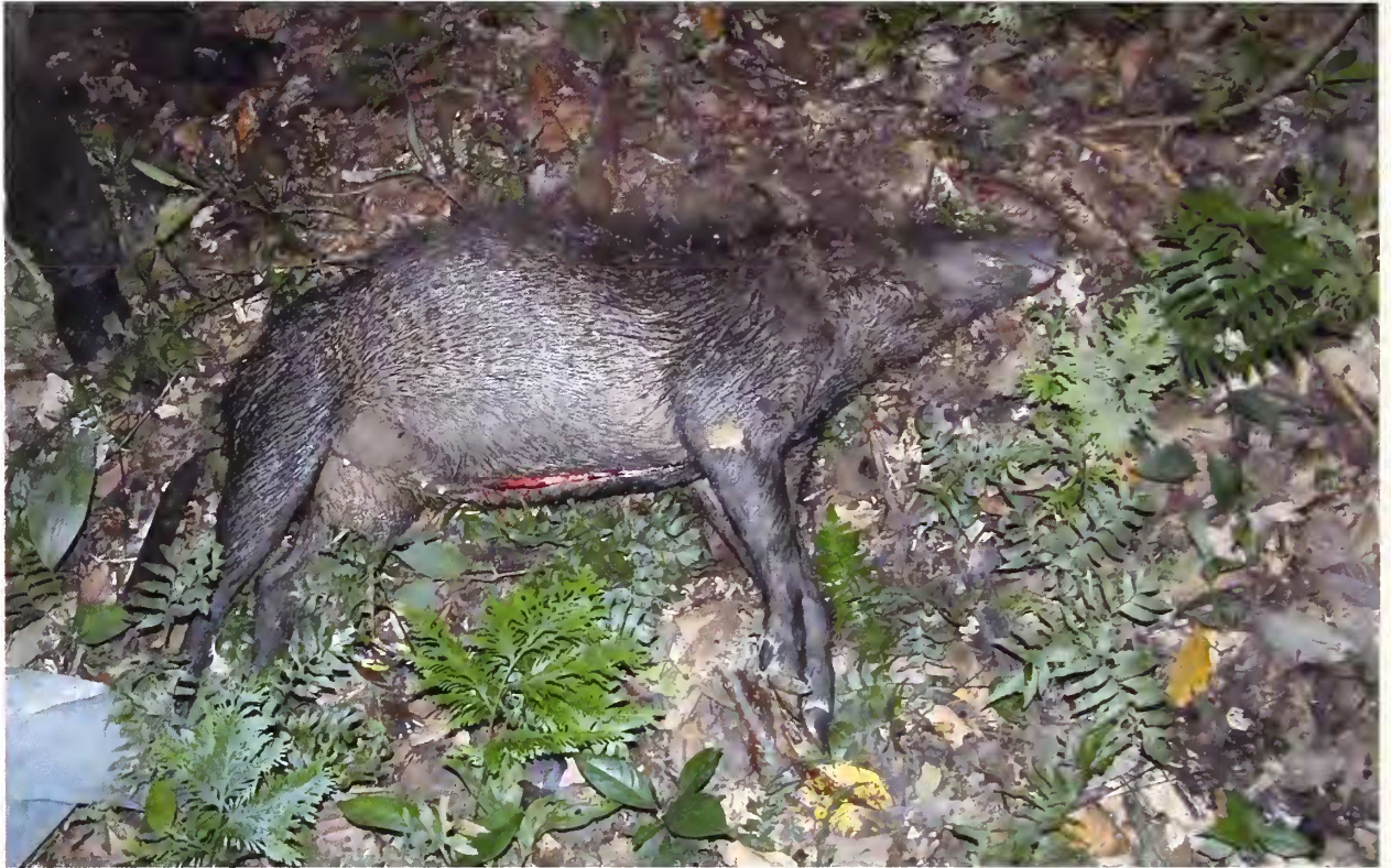
Fig. 1. Young female Pecari maximus , shot at Bioceanica, Bolivia.